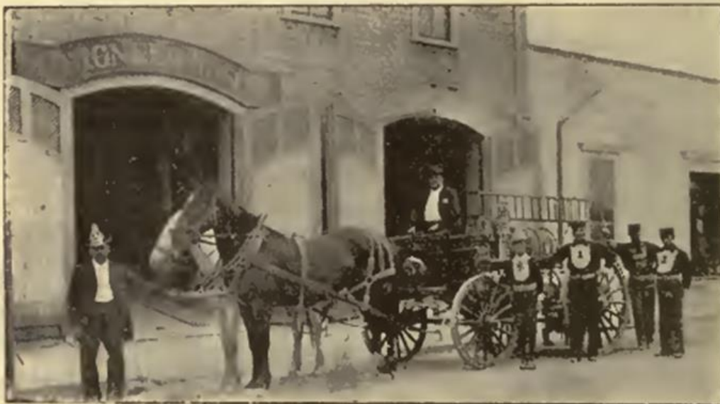
The regular volume of inland freighting from Tucson by

Tucson's first serious fire took place in 1880, and led to the temporary organization of a fire department. This organization was recognized by the city in 1883, and formally established as the fire department of Tucson. A building and fire bell tower were erected at a cost of about $4,000, and an equipment supplied. This equipment now comprises a large chemical engine, hook and ladder and two hose carts with 1,000 feet of first-class hose. The water supply being poor and under very small pressure, the equipment was never efficient until the chemical engine was purchased by the city. The department has a membership of forty-five volunteers, who readily respond to every call, and the officers are: Chief, J. D. Boleyn; assistant, Frank Saladin; Wm. Reid, foreman and treasurer; secretary, Al. Ezekiels; steward, Rich. Brophy.